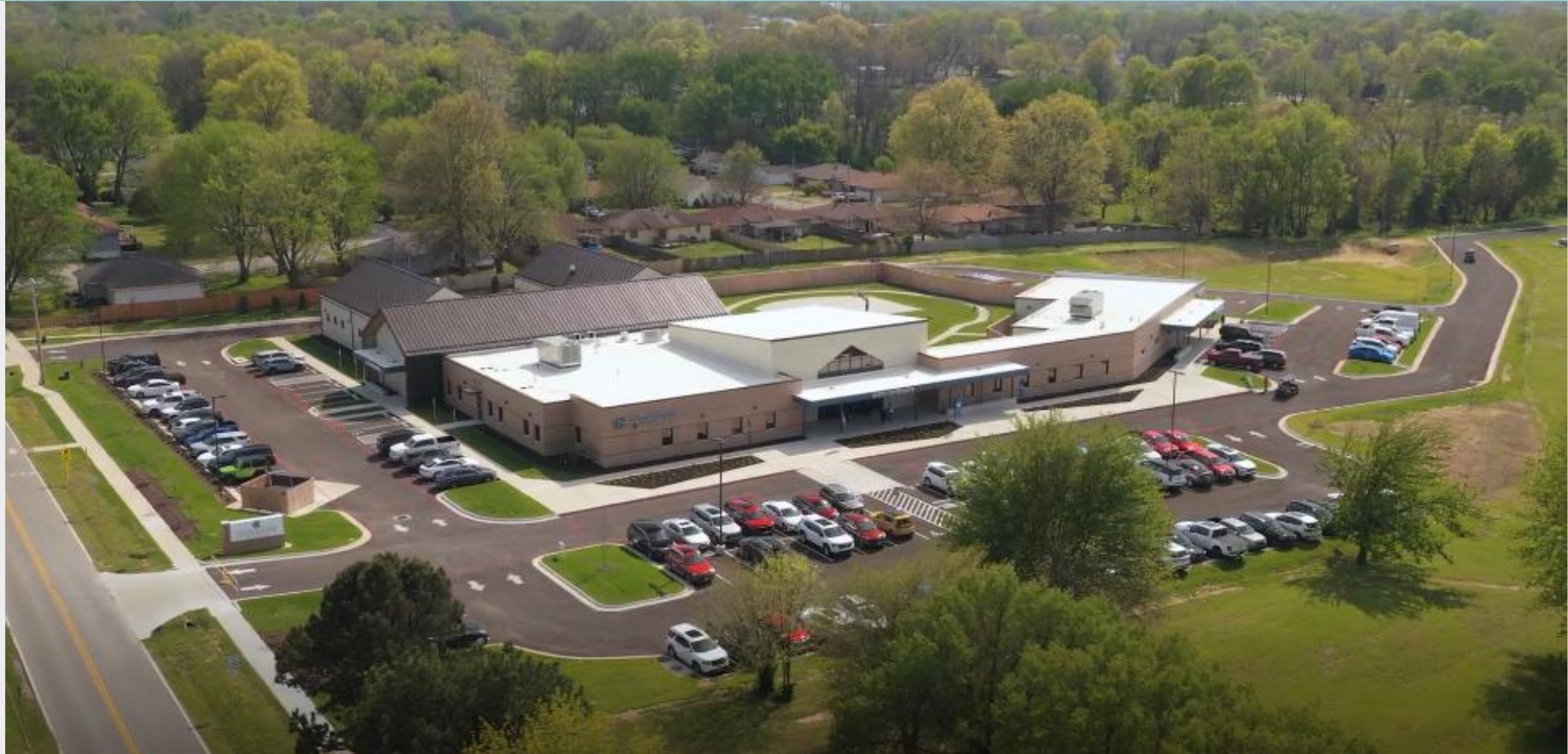
Drone photo of YRC from April 9 ribbon cutting