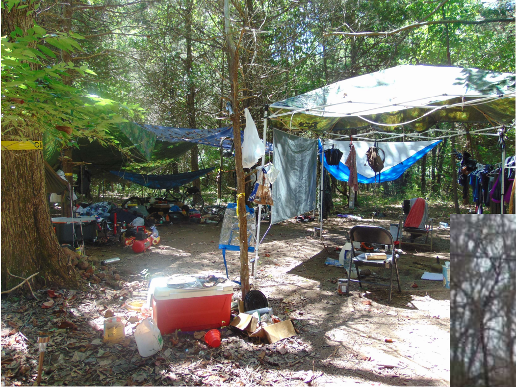
Living in a tent /camping