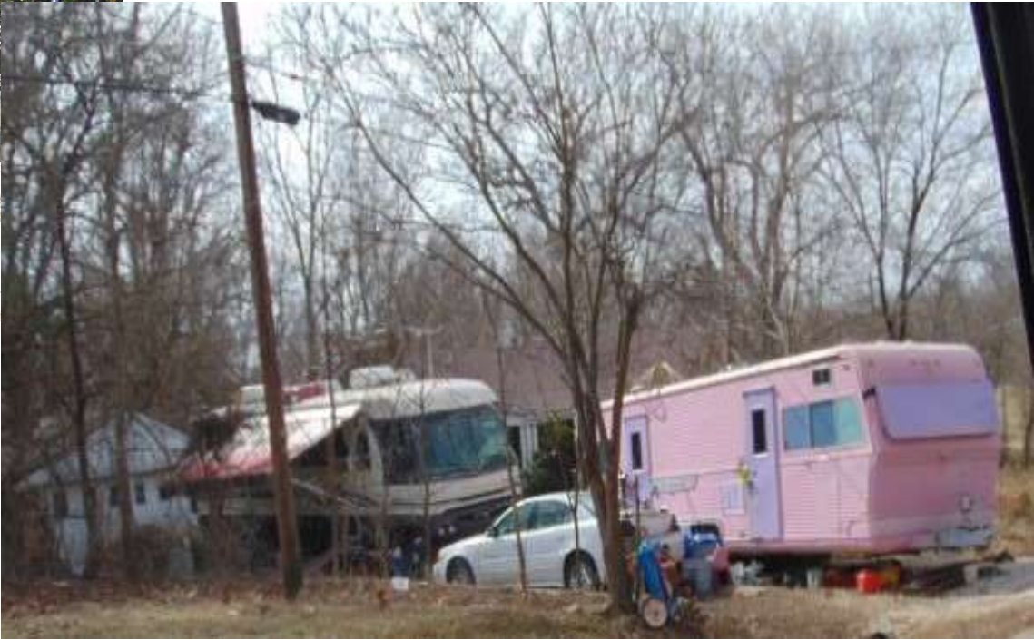
Living in a travel trailer