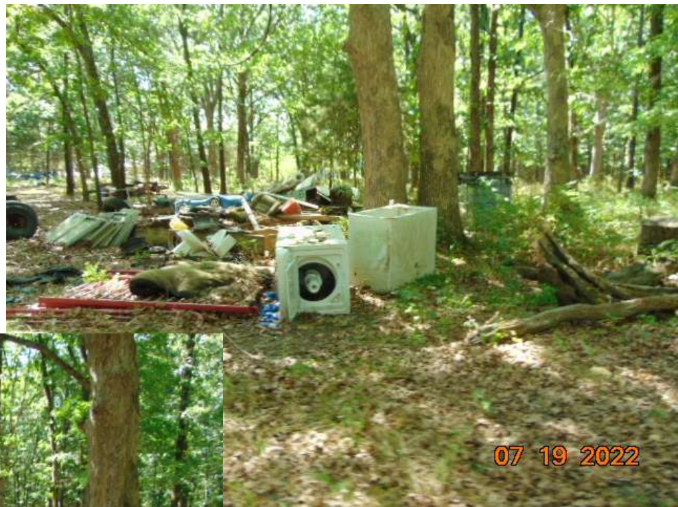
Trash and Dumping Immobilized Vehicles