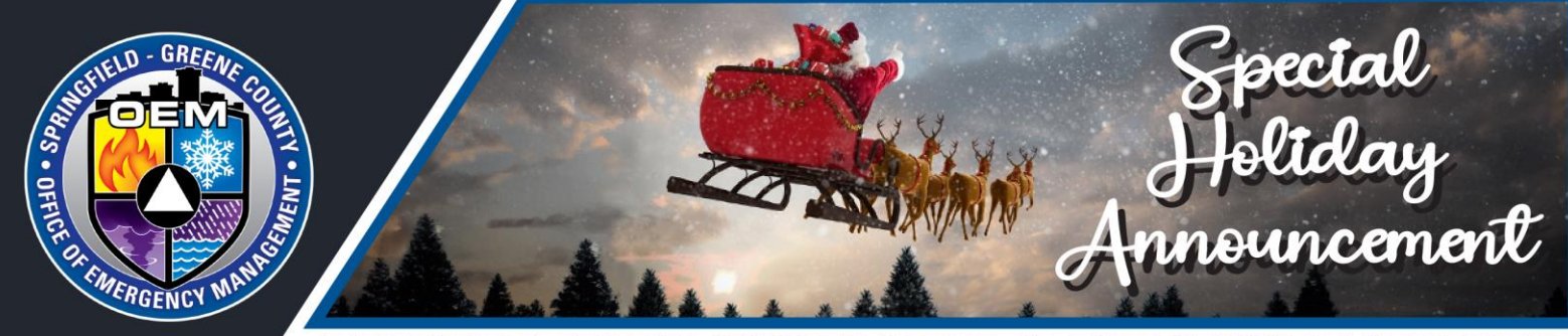
SPRINGFIELD-GREENE COUNTY OFFICE OF EMERGENCY MANAGEMENT

Emergency Operations Center Partner Agencies