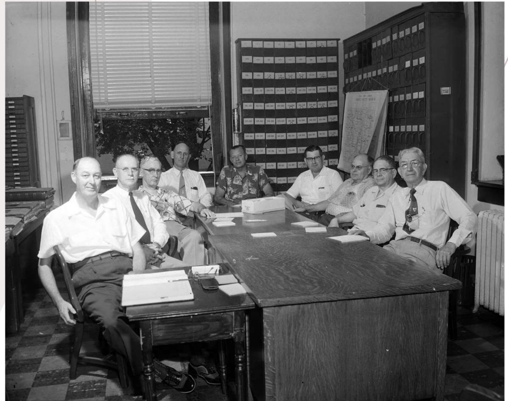
Board of Equalization | 1956