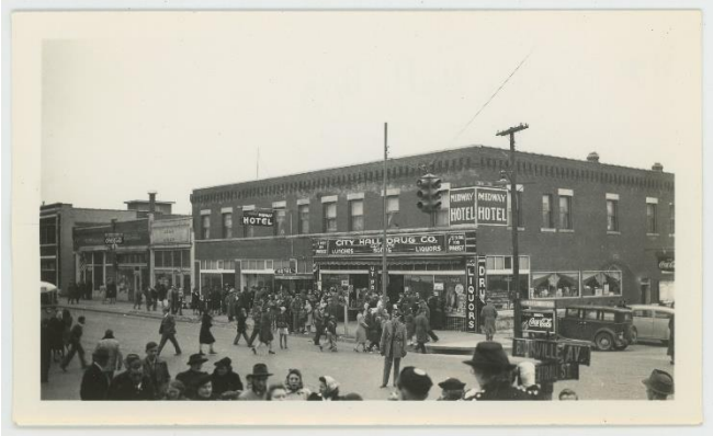
a Springfield hotel