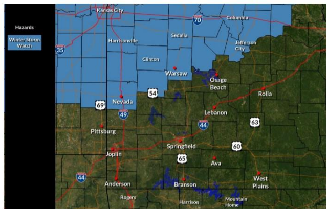
Winter Storm Watch from 6 AM Saturday to 12 AM Sunday