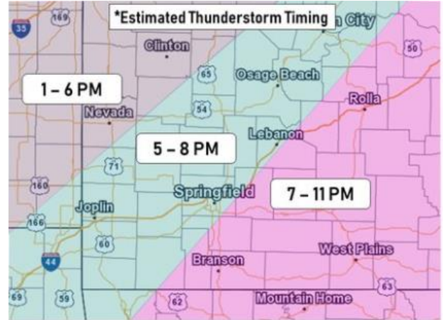
Tornado Risk Valid: 05/04/2020 02:00 PM - 05/05/2020 07:00 AM CDT