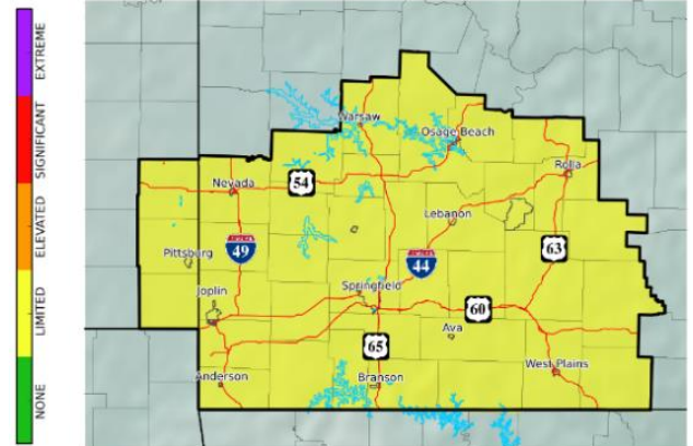
Tornado Risk Valid: 05/18/2019 03:00 AM - 05/19/2019 07:00 AM CDT

National Weather Service Springfield Missouri 05/18/2019 03:45 AM CDT Follow Us: f t v weather.gov/sgf